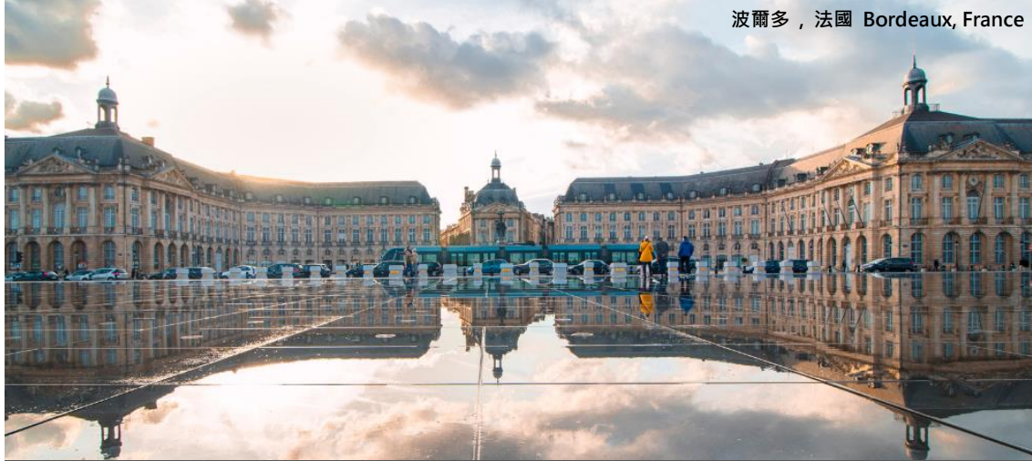
波爾多，法國 Bordeaux, France