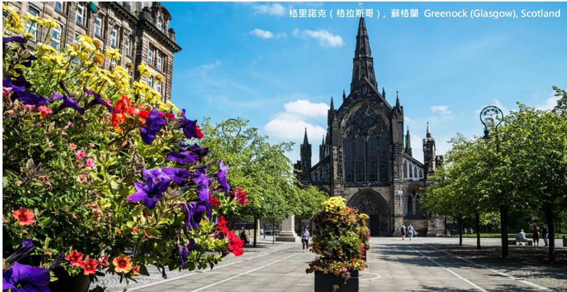
格里諾克 (格拉斯哥), 蘇格蘭 Greenock (Glasgow), Scotland