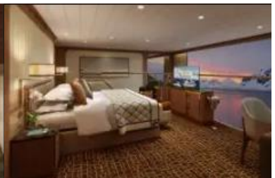
Owner's Suite 1,023 sq ft 包括 484 sq ft 露台