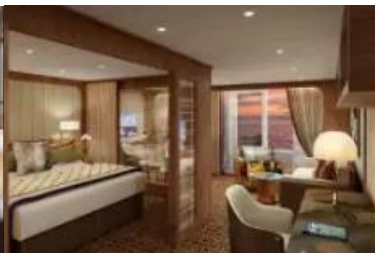
Penthouse Suite 527 sq ft 包括 97 sq ft 露台