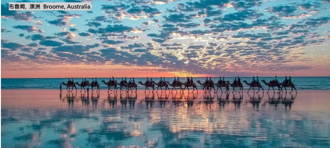
布魯姆, 澳洲 Broome, Australia