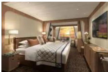
Veranda Suite 355 sq ft 包括 75 sq ft 露台

THE OFFICIAL CRUISE PARTNER OF UNESCO WORLD HERITAGE