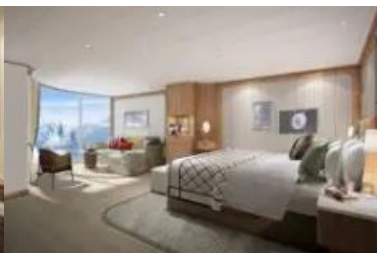
Panorama Veranda Suite 417 sq ft 包括 85 sq ft 露台