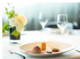
Table La Rive/ Table d'Or 10 位客人提供私密的用餐體驗