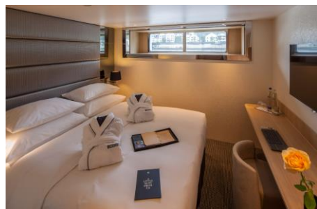
標準套房(Category E) 161 平方公尺