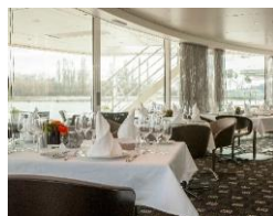
Portobellos /L' Amour 義大利、法國或葡萄牙美食