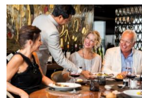
Chef's Table 10 道菜晚餐