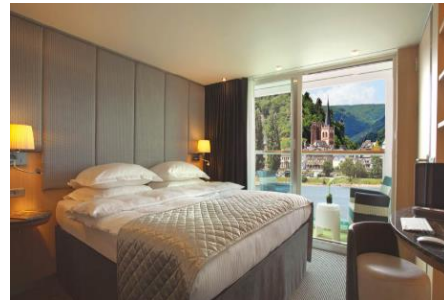
豪華陽台套房(Category BD) 225 平方公尺