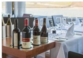
Crystal Dining 主餐廳