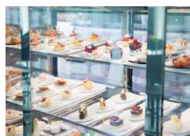
River Café 全天餐飲選擇小吃