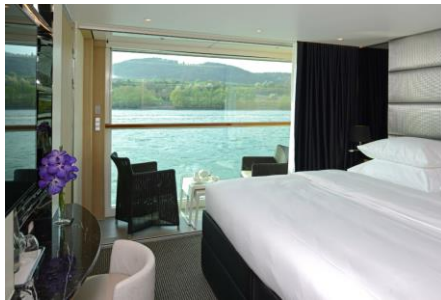
河景陽台套房(Category C) 205 平方公尺