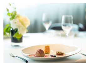
Table La Rive/ Table d'Or 10 位客人提供私密的用 餐體驗