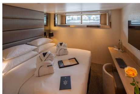
標準套房(Category E) 161 平方公尺