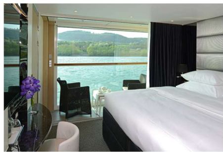
河景陽台套房(Category C) 205 平方公尺