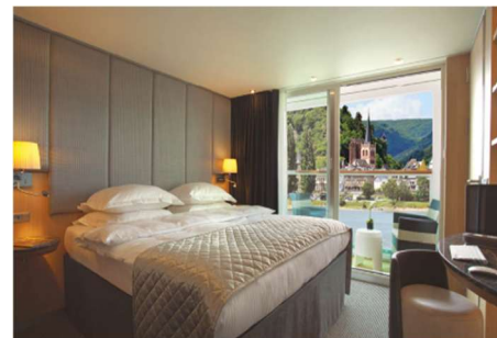
豪華陽台套房(Category BD) 225 平方公尺