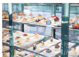
River Café 全天餐飲選擇小吃