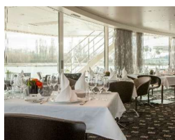
Portobellos /L' Amour 義大利、法國或葡萄牙 美食