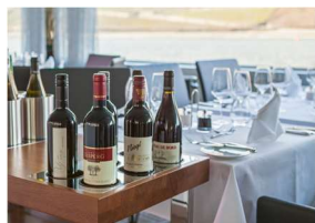
Crystal Dining 主餐廳