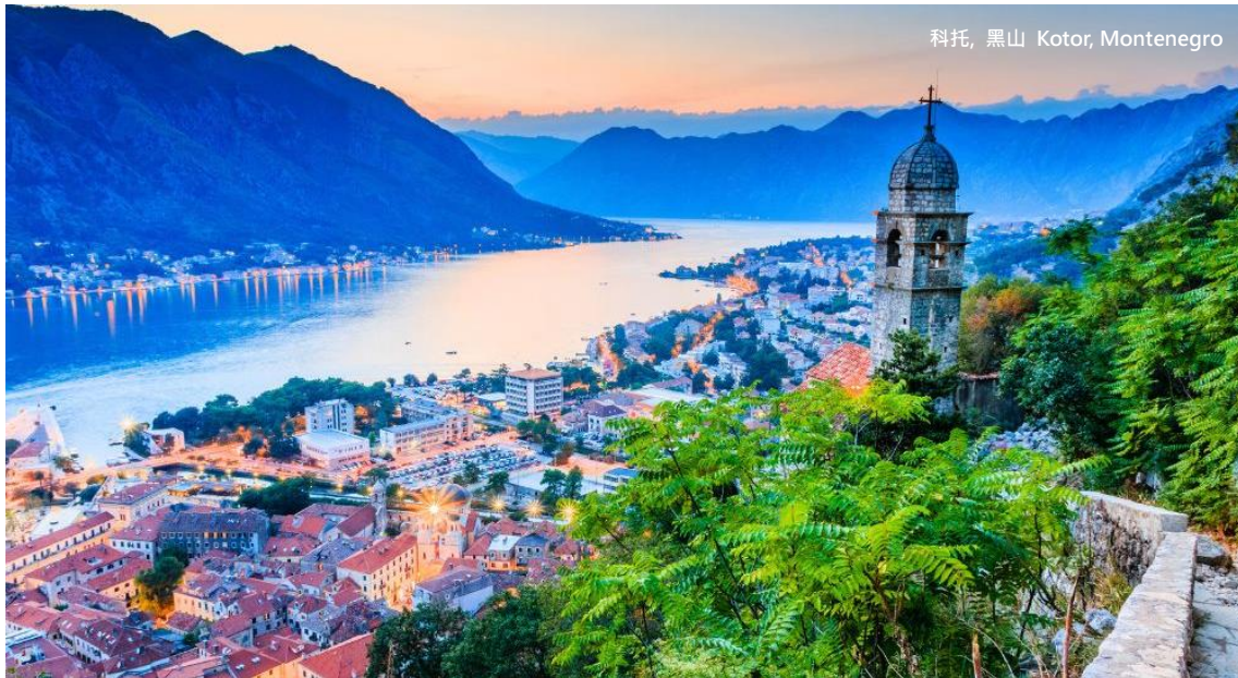
科托, 黑山 Kotor, Montenegro

Regent SEVEN SEAS CRUISES AN UNRIVALLED EXPERIENCE™