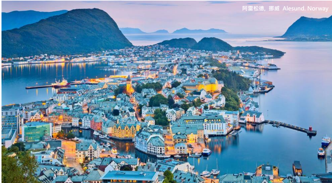
阿雷松德, 挪威 Alesund, Norway

Regent SEVEN SEAS CRUISES AN UNRIVALLED EXPERIENCE™