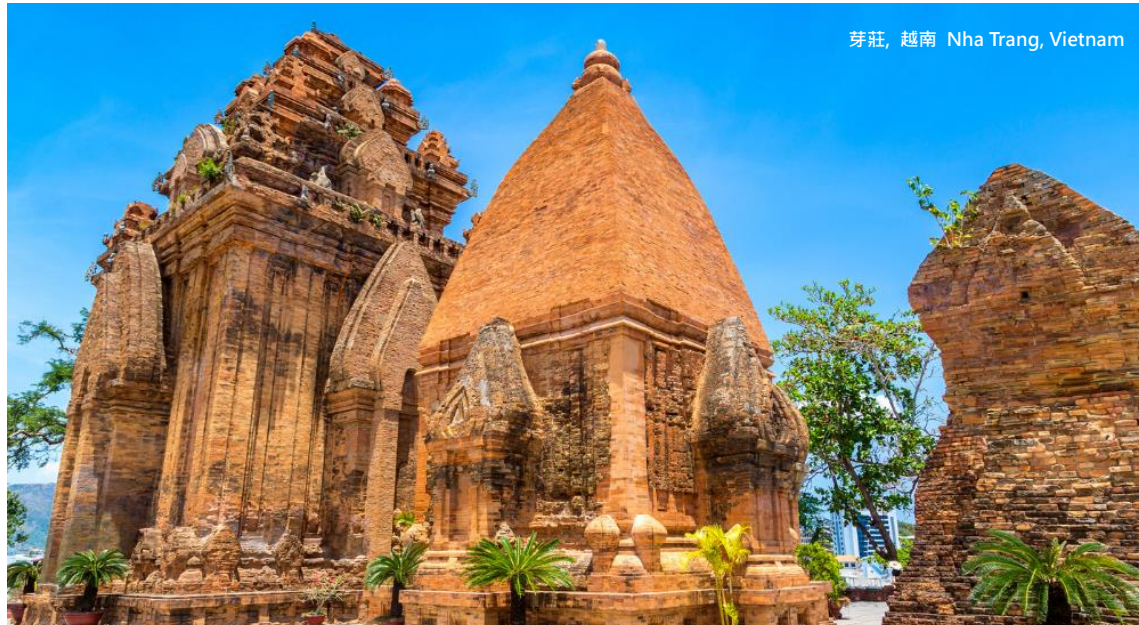
芽莊, 越南 Nha Trang, Vietnam