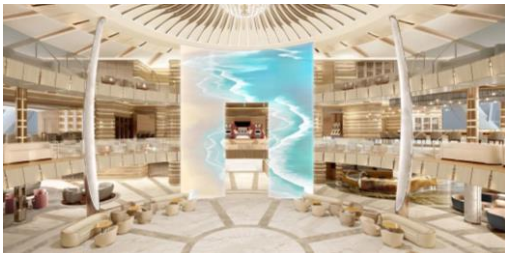
Princess 標誌性中庭 Piazza，提供外向懸浮空間，舒適的座椅和可欣賞海景的區域