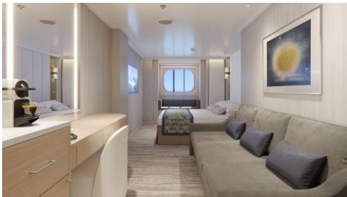
海景房 Premium Oceanview - 212 sq. ft.

太陽公主號 她是第三艘以“太陽公主”命名的郵輪，是公主郵輪有史以來最大型的郵輪，亦是船隊中第一艘以液化天然氣 (LNG) 提供動力的郵輪，這種燃料亦減少對環境的污染。全新艙房級別體驗，當中包括獨享的休閒設施及特色餐廳等..... 將於 2024 年 2 月正式下水，為旅客帶來獨特的地中海郵輪新體驗。