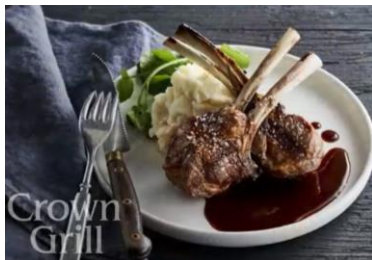
Crown Grill · 曾被評為最佳遊輪牛排館