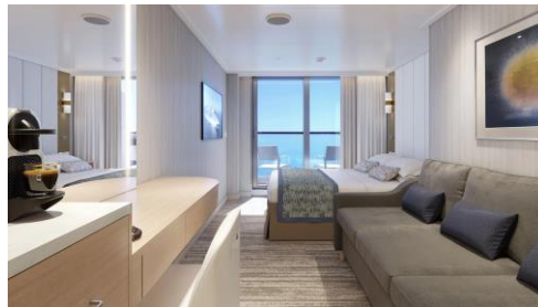
露台房 Deluxe Balcony - 235 sq. ft.