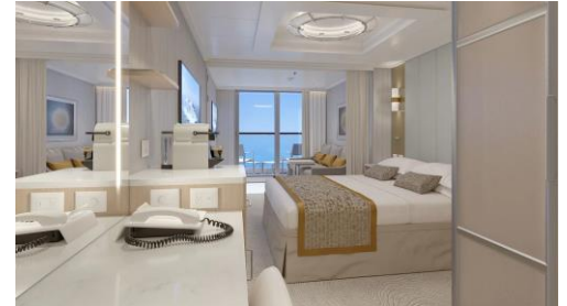
迷你套房 Mini Suite - 303 sq. ft.