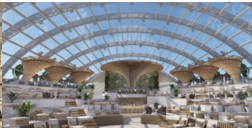
The Dome 是一個多層有蓋甲板，是遊輪上建造的首個真正的玻璃封閉圓頂