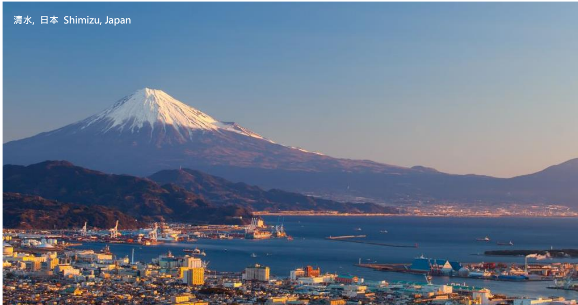
清水, 日本 Shimizu, Japan