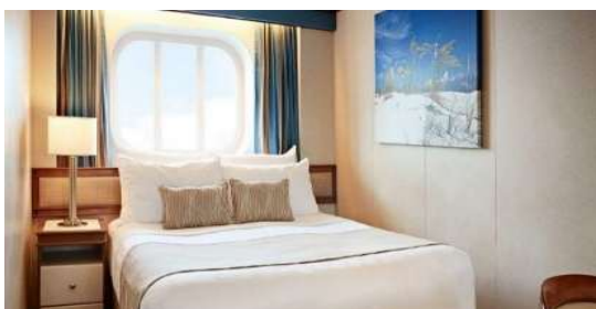
海景房 Oceanview 約146至206 sq. ft.