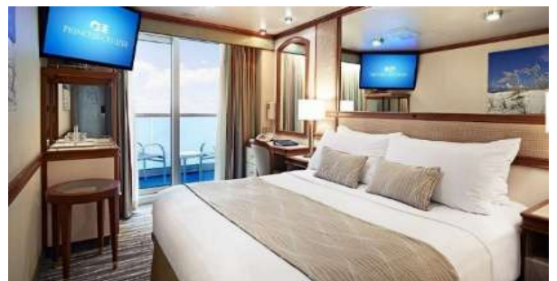
露台房 Balcony 約214至222 sq. ft.