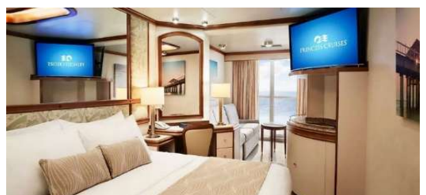
迷你套房 Mini-Suite 約323 sq. ft.