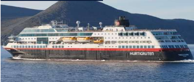
山妖峽灣號 MS Trollfjord

從卑爾根溫暖的氣候起程，沿海岸航行駛進寒冬中的北極圈內，一路感受長短不同的白晝，由充滿生命力的陽光到白茫茫的冰天雪地，讓您可以一個旅程中經歷春、夏與冬。