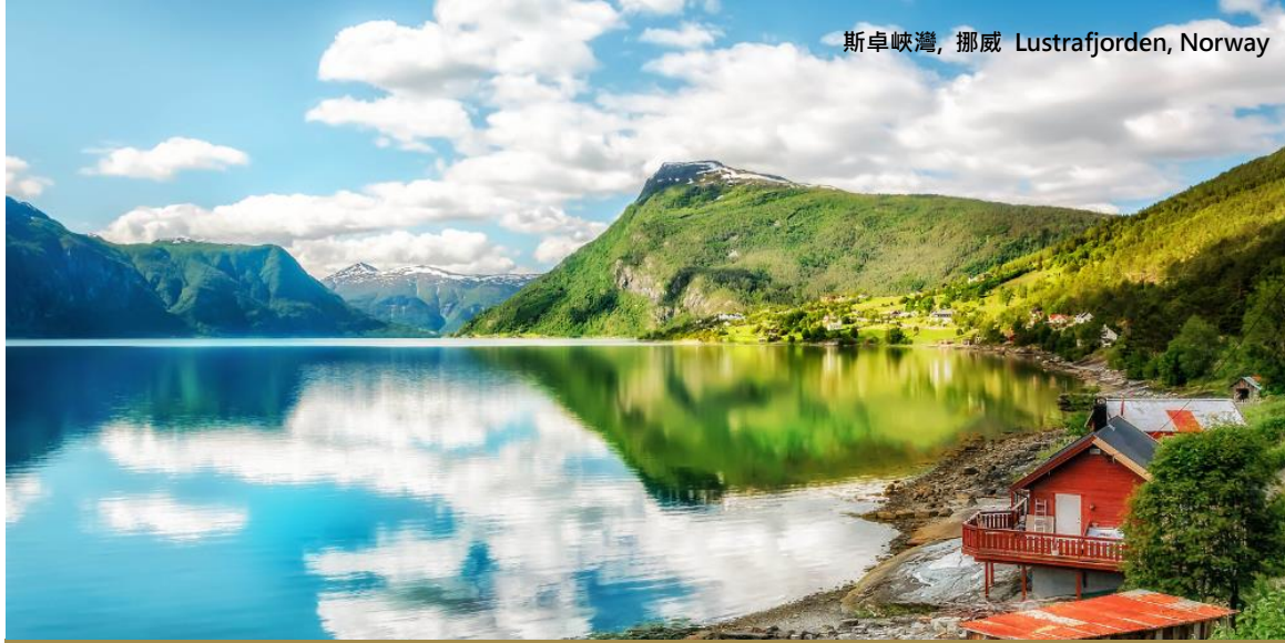
斯卓峽灣, 挪威 Lustrafjorden, Norway