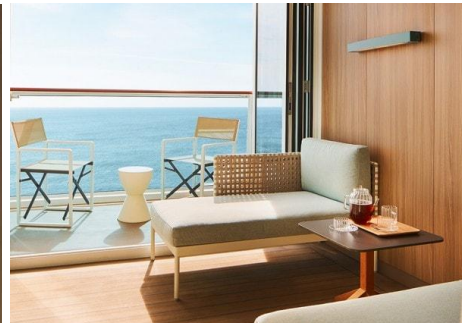
露台艙房 Balcony Size: 248 sqf