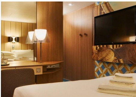
內艙房 Inside Size: 150 sqf

Costa Smeralda 是意大利甜蜜生活的代名詞：無憂無慮，微風吹亂你的頭髮，永遠俯瞰大海。每晚您都會欣賞到新的表演和表演、位於船最高甲板上的水上公園、新一代水療中心和健身房等等。Costa Smeralda關心環境，為負責任的創新和日益永續的旅行鋪平道路。