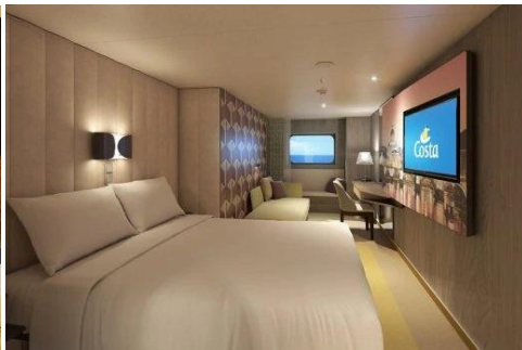
海景艙房 Oceanview Size: 191 sqf