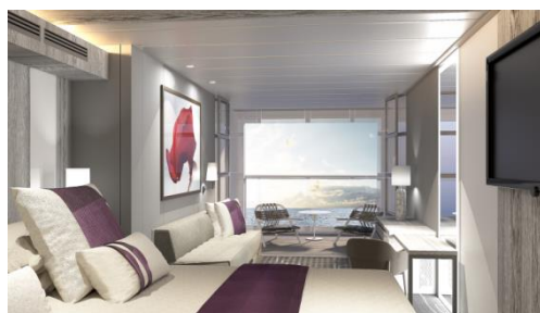
Edge Staterooms with Infinite Veranda

曾負責設計杜拜帆船酒店的英籍名建築設計師 Tom Wright，獲邀為郵輪設計 Magic Carpet。這是個設於船邊的大型可升降平台，當在 2 樓、5 樓、14 樓及 16 樓停泊，變身戶外甲板、泳池區的延伸、接駁艇等候區域，或變成無邊際海景餐廳等不同功能，成為海上魔氈。