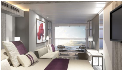
Edge Staterooms with Infinite Verandas SM

曾負責設計杜拜帆船酒店的英籍名建築設計師 Tom Wright，獲邀為郵輪設計的 Magic Carpet。這是個設於船邊的大型可升降平臺，當 2 樓、5 樓、14 樓及 16 樓停泊，變身戶外甲板、泳池區的延伸、接駁艇等候區域，或變成無邊際海景餐廳等不同功能，成為海上魔氈。