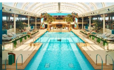
La spiaggia beach club