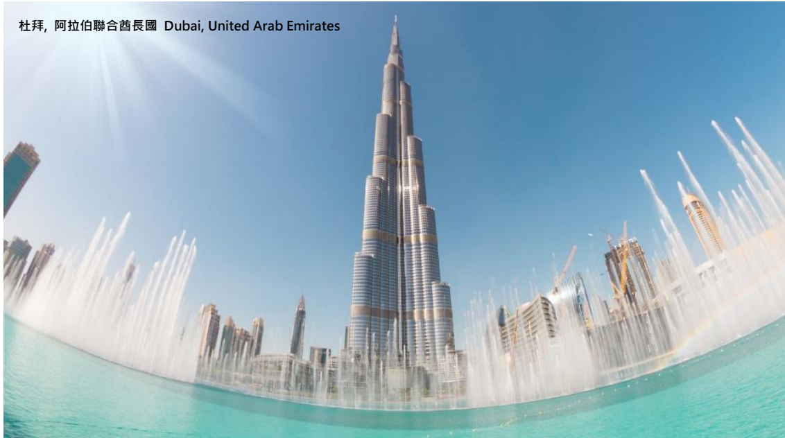
杜拜, 阿拉伯聯合酋長國 Dubai, United Arab Emirates