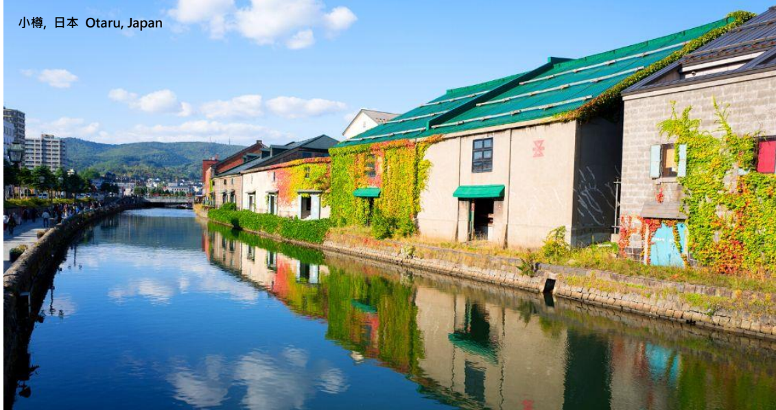
小樽, 日本 Otaru, Japan